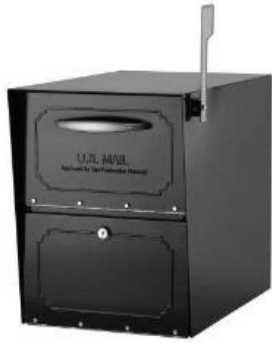
Oasis brand locking mailbox: Junior (model #620010B-10) 11.50" wide X 18" deep X 15" tall