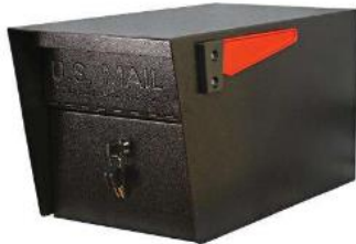
Mail Boss brand locking mailbox: Mail Manager (model #7506BB) 10.75 wide X 21 long X 11.25 tall Package Master (model #7206) 12" wide X 21.5" long X 16.5" tall