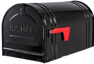
Postal Pro Remington locking mailbox (model #PPT3LBL) 11.25" wide X 25" long X 12" tall