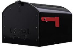
Gibraltar Storehouse non-locking mailbox (model #SH400B01) 14.3" wide X 18.1" long x 12.4" tall

NOTE: Oversize mailboxes may require a sturdier support base. All changes to the support base must be approved by the ACC prior to installation.