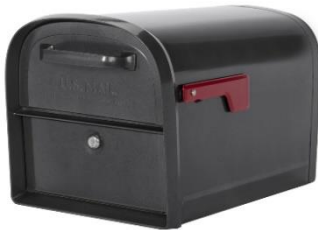
Oasis brand locking mailbox: 360 (model #6300P-10) 11.2" wide X 20" long X 11.5 tall