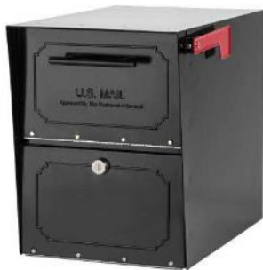
Oasis brand locking mailbox: Classic (model #6200B-10) 11.50" wide X 18.1" deep X 15.1" tall